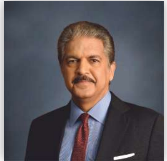
Anand G. Mahindra Chairman, Mahindra Group Chancellor, Mahindra University

Mr. Anand Mahindra is the Chairman of the US $20.7 billion Mahindra Group and the Executive Chairman of Mahindra & Mahindra Ltd.